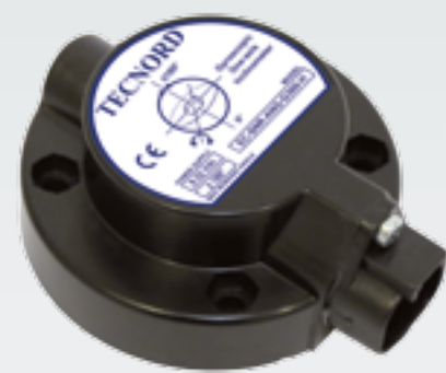
INCLINOMETER WITH INTEGRATED GYROSCOPE